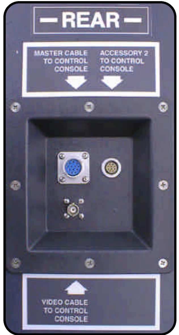
NOSE MOUNT (REAR)