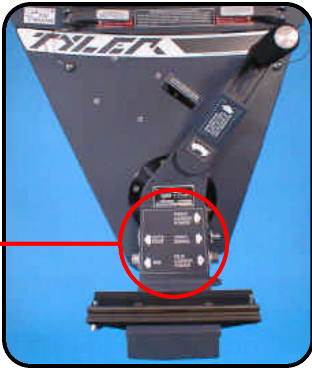
NOSE MOUNT (LEFT SIDE)