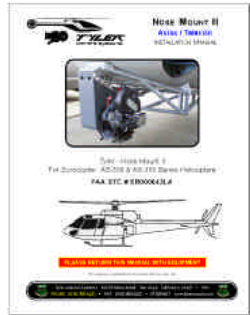
Tyler - Nose Mount For Eurocopter Astar / Twinstar AS-350 & AS-355 Series Helicopters