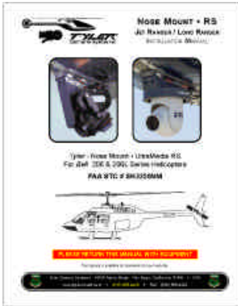
Tyler - Nose Mount • UltraMedia RS For Bell Jet Ranger / Long Ranger 206 & 206L Series Helicopters

Refer to the following Installation Manuals for instructions on installing Tyler Nose Mount II on helicopter: (Available for download from our web site)